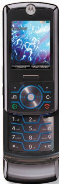
MOTOROLA'S Motorizr Z6 Linux-based handset

Participating vendors, however, are optimistic. With good execution in 2007 by key players, mobile Linux is well-positioned to become a common handset choice within the next two to three years and a viable option for IT looking to extend applications to mobile devices. ■